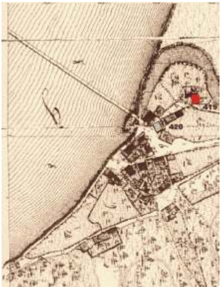
▲ Location of Schiffmeisterhaus in 1828

During that period, the loft of Schiffmeisterhaus was used to store goods, mainly salt and grain.