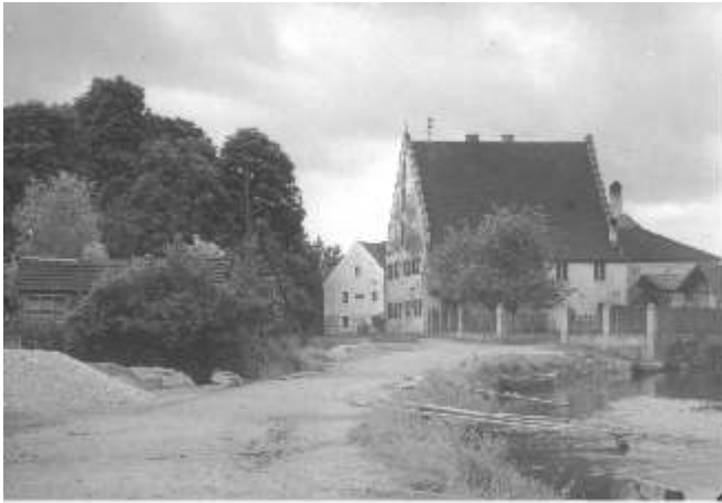
▲ Schiffmeisterhaus around 1920

The listed Schiffmeisterhaus is one of the oldest town houses in Deggendorf. Its building substance dates back to the Middle Ages. It received its current form in the 18th century.