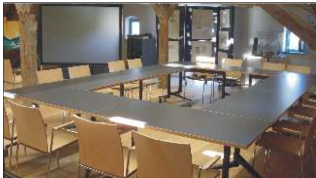
▲ Example of seating arrangement for a conference

For detailed information on the current exhibition, please visit our website at www.schiffmeisterhaus.de .