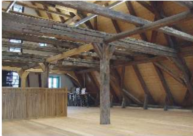
▲ The historical functional room

Since 2008, the building has been open to the public and used as a center for information, exhibitions and events. Apart from information about the house itself, visitors can also enjoy annually changing exhibitions.